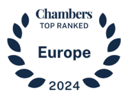
Schellenberg Wittmer Ltd