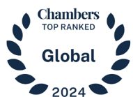
Schellenberg Wittmer Ltd

Schellenberg Wittmer Ltd is your leading Swiss business law firm with more than 150 lawyers in Zurich and Geneva, and an office in Singapore. We take care of all your legal needs – transactions, advisory, disputes.